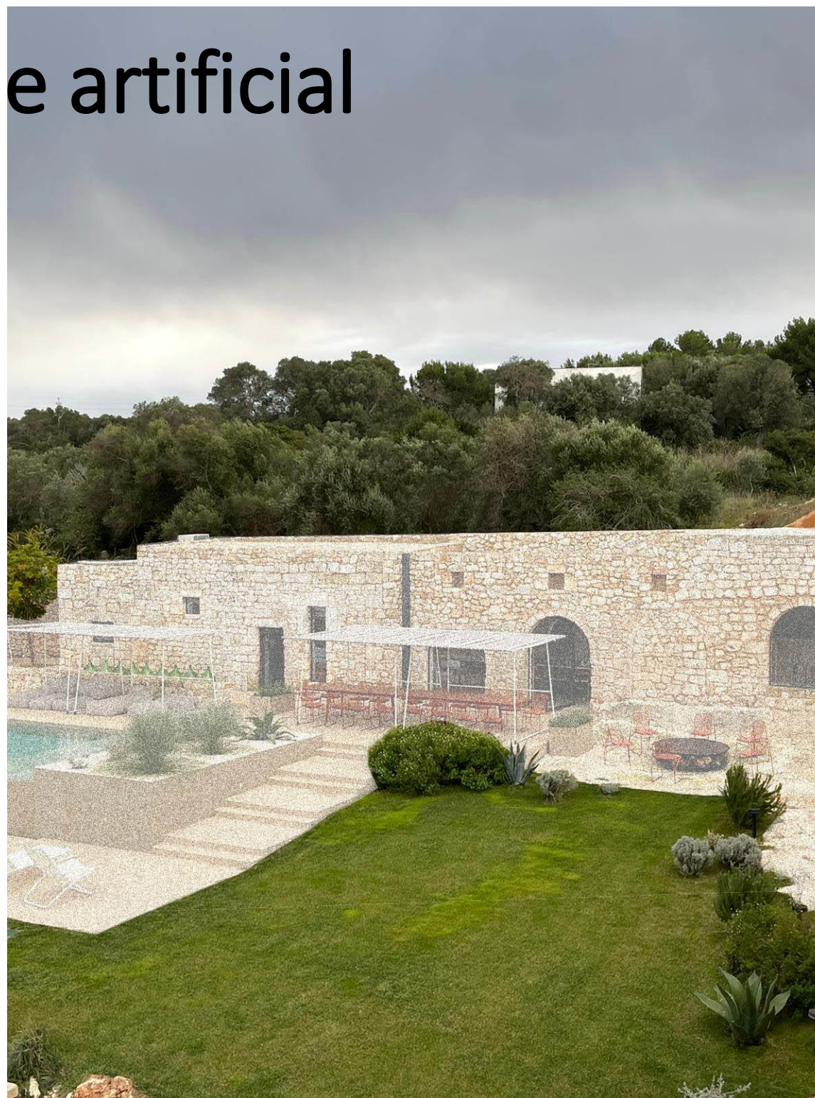
balance between wild/native/natural and tamed/artificial